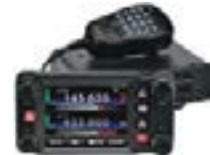
FTM-400XD 2M/440 Mobile