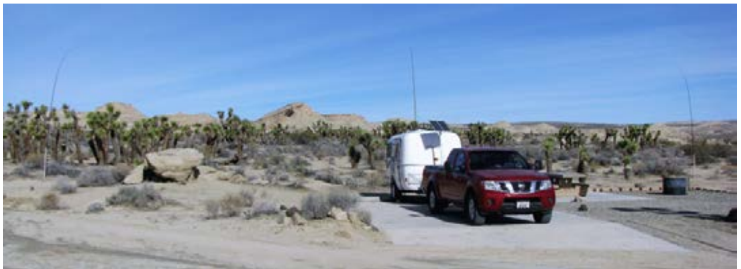
Figure 3. Modified NorCal Doublet antenna

I thoroughly enjoyed my first Winter Field Day operating experience. Give it a try if you can.