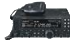
FT-450D 100W HF + 6M Transceiver