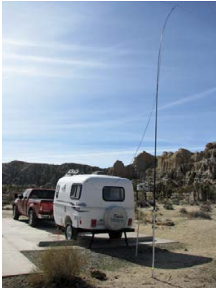
Figure 2. 20-foot Wonderpole

Installation was completed within an hour. The fishing pole method worked well in an area with no natural support structures.