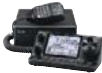
IC-7100 All Mode Transceiver