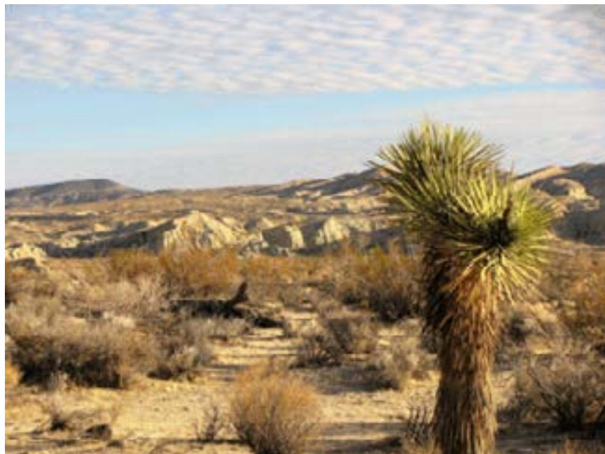
Figure 5. Outstanding scenery