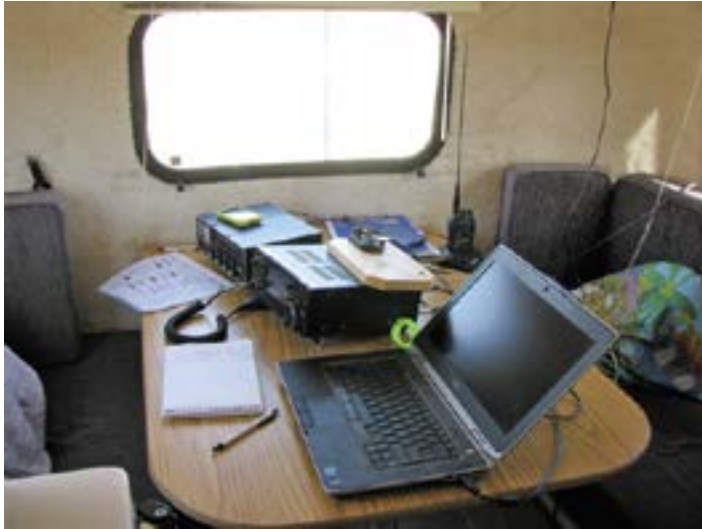
Figure 1. Station

While returning from Quartzfest in AZ with a Casita travel trailer in tow, I detoured to a campground northeast of Mojave, CA to participate in Winter Field Day 2019 for my first time. This event seasonally mirrors Field Day to allow hams to deploy during a potentially harsh winter month.